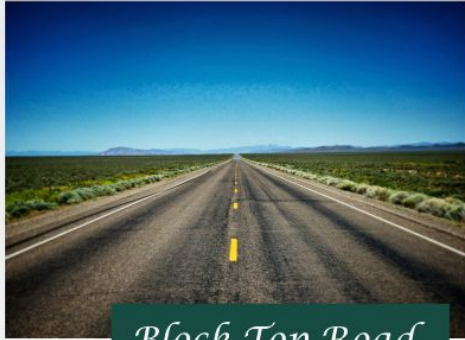
Block Top Road