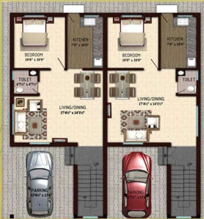
PLOT NO-2A & 3A