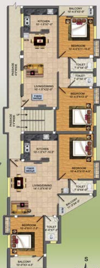
A-BLOCK STILT&FIRST& SECOND FLOOR PLAN