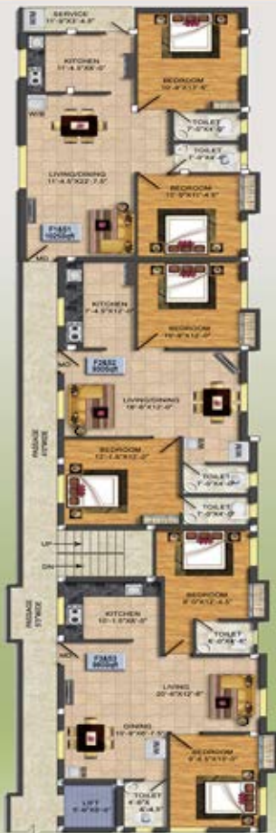
B-BLOCK FIRST&SECOND FLOOR PLAN