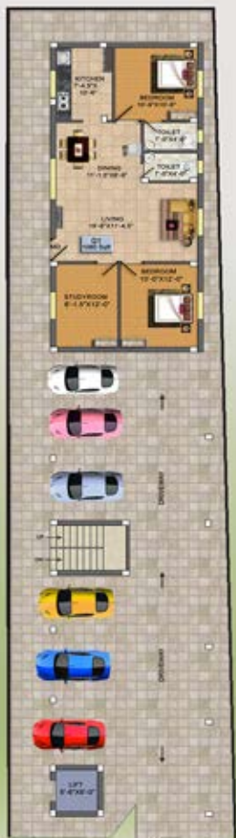
B-BLOCK STILT CUM GROUND FLOOR PLAN