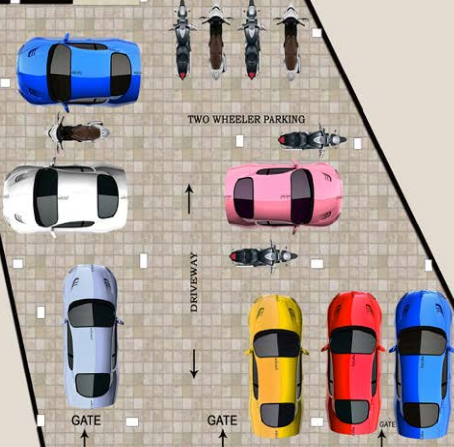
STILT CUM GROUND FLOOR PLAN