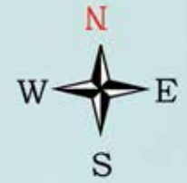
SECOND & THIRD FLOOR PLAN