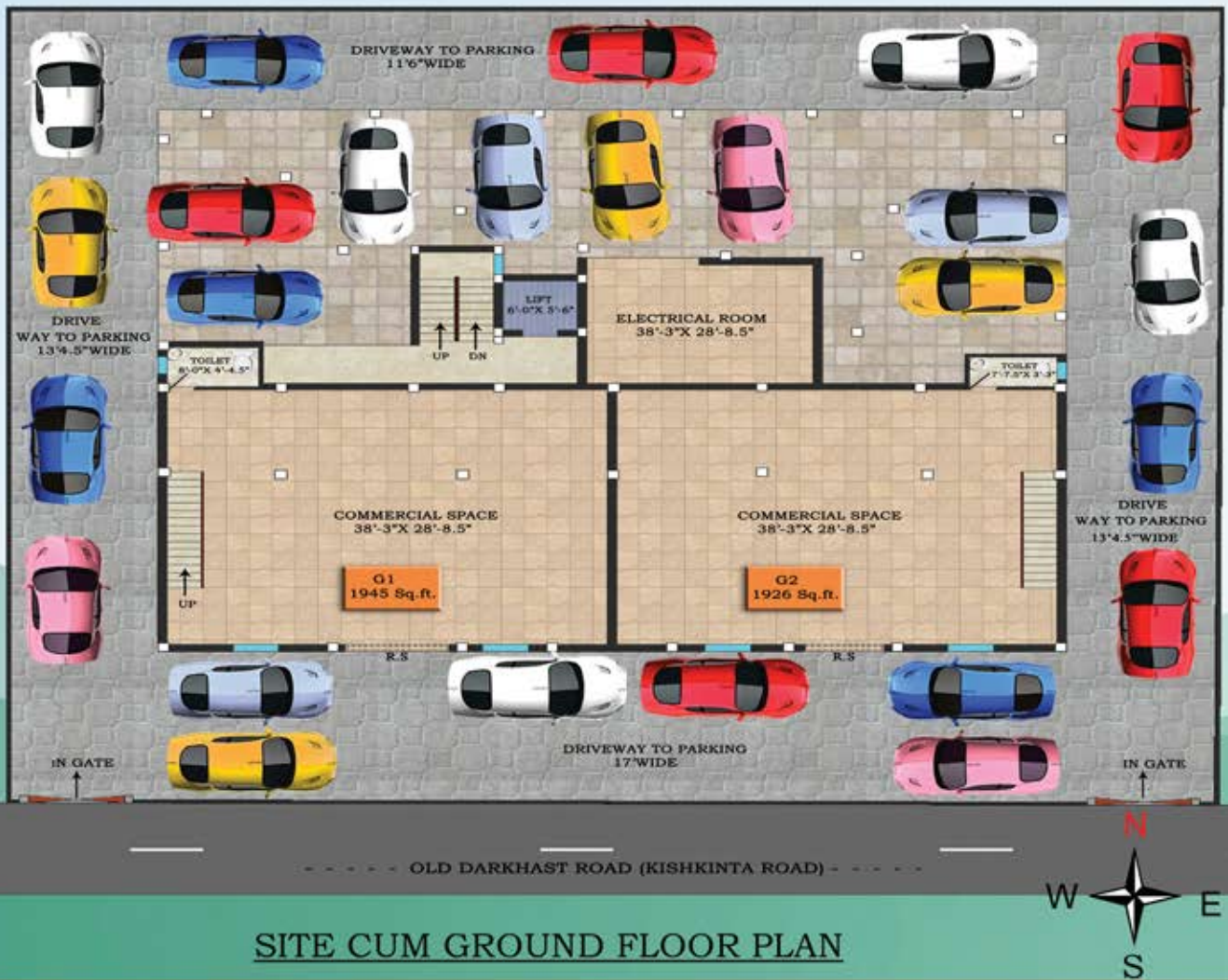
SITE CUM GROUND FLOOR PLAN