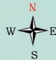
MEZZANINE & FIRST FLOOR FLOOR PLAN